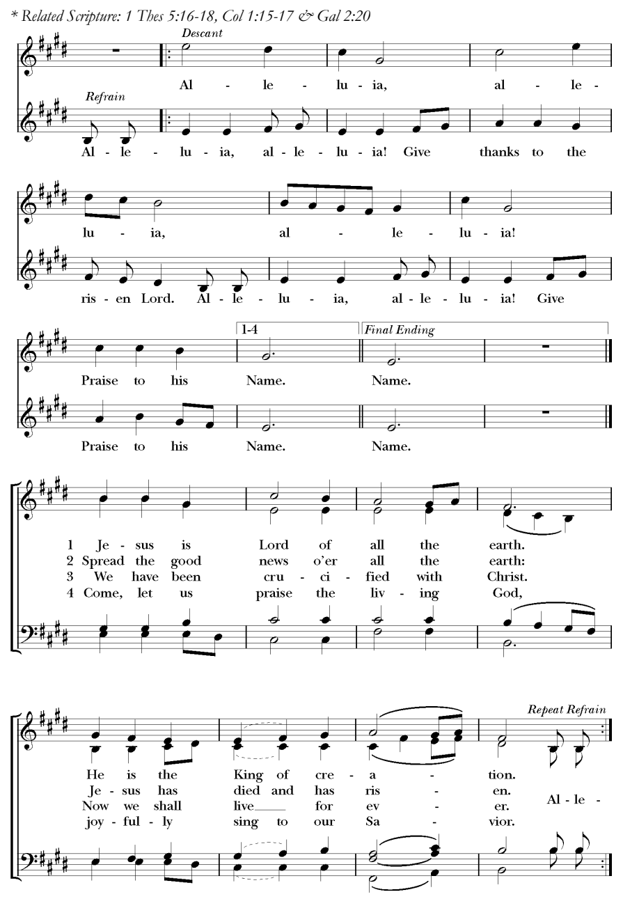
The descant may be sung after stanzas 3 and 4.